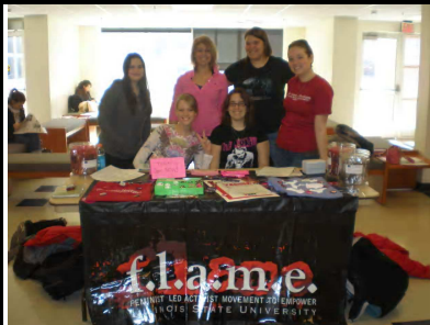
F.L.A.M.E. Tabling in Schroeder

“Cautious, careful people, always casting about to preserve their reputation and social standing, never can bring about a reform. Those who are really in earnest must be willing to be anything or nothing in the world's estimation”—Susan B. Anthony